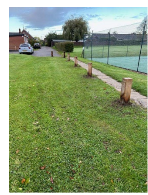
New posts at the Tennis Courts