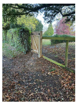
A new gate into the Memorial Garden from Footpath 26

Although the cutting season is drawing to a close, the grounds contrators have been out and about completing some of the projects the Estates Committee has been working to bring about this summer, including: