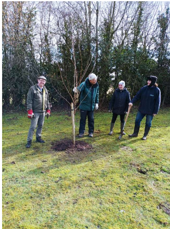
Volunteers planting the Cherry Trees in Wickhambrook Cemetery as part of Queen's Green Canopy

At the end of February we planted seven flowering cherry trees in Wickhambrook Cemetery. Thanks go out to all our volunteers for their help and good cheer on the day!