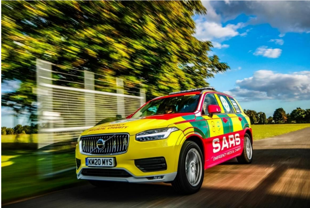
Our new rapid response vehicle SMED26

Both cars carry equipment and drugs not found on frontline ambulances and are crewed by clinicians who can undertake complex procedures which would not normally be possible outside the hospital environment. These can be truly lifesaving interventions. Already in 2020, we have increased the volume of team shifts by over 30% and we are working to recruit additional clinicians into the charity to help crew more shifts.