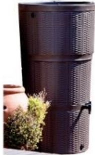
150 litre Rattan Water Butt Polybutt