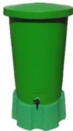
200 Litre Water Butt